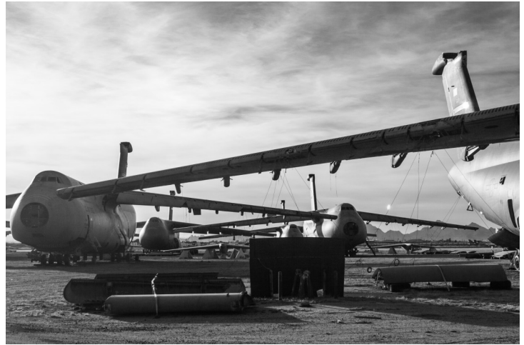
C-5s with engines removed— it looks like the entire C-5 fleet is here. One of these huge aircraft by itself is impressive but when you see so many together it is mind boggling

Now, on to some pictures from the “Boneyard”