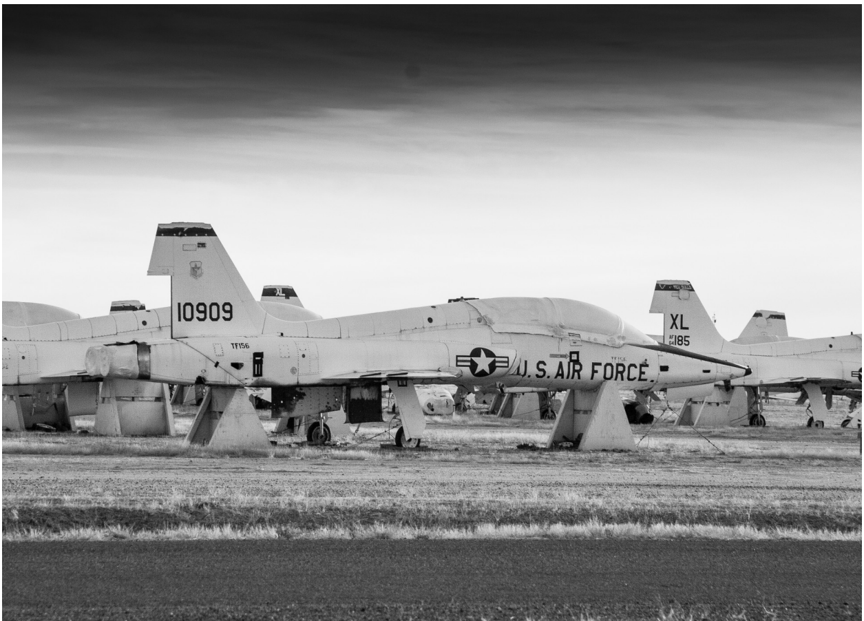
T-38 Talon supersonic trainers

The workhorse of the Viet Nam conflict used for everything from Air Superiority to high altitude bombing (referred to as Sky Pukes by the guys who did close air support in other fighters)