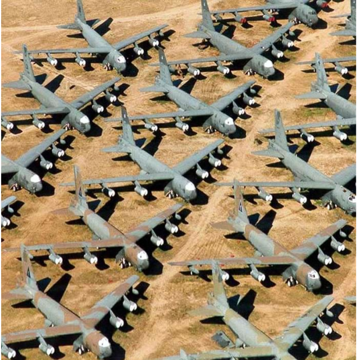
B-52s awaiting destruction as part of the START Treaty

A once proud Navy F-14 minus its engines sits in the dirt at the aircraft storage site in Tucson, AZ known as the “Boneyard”. More pictures and facts about this facility in this issue.