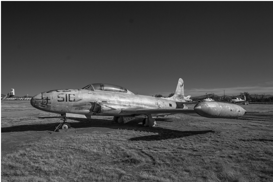
A Lockheed T-33 better known as Lockheedus Swinus Subsonicus. Used by the Air Force for advanced pilot training. Curiously, this had Marine Corps markings.