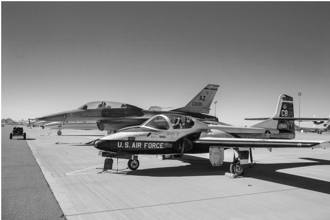
T-37 trainer and Arizona ANG F-16B

These had just been delivered to the “Boneyard” and had not been prepared for storage yet. This is one of my favorite pictures as the T-37 was the first jet I flew in the