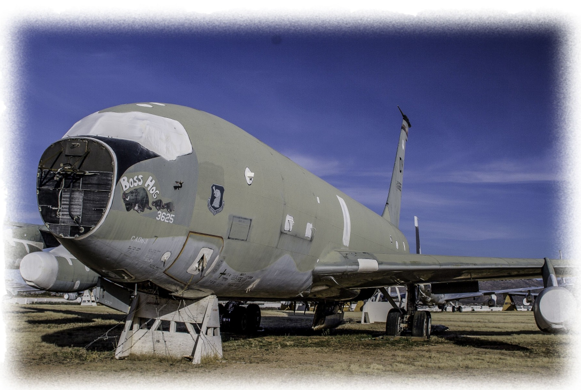
Boeing KC-135 in the Boneyard