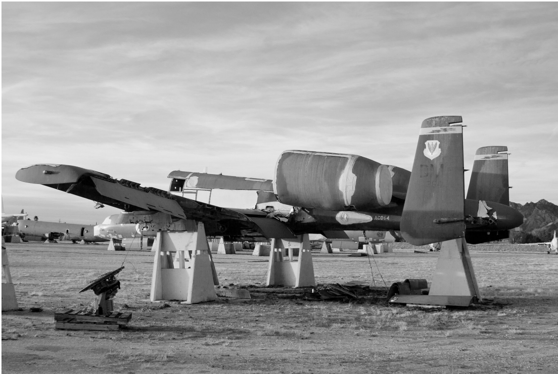
An A-10 with lots of missing parts