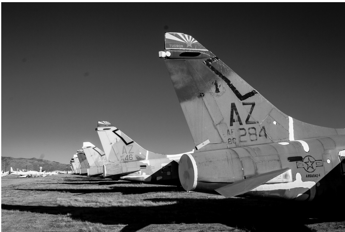
Tucson Air Guard A-7Ds

One of the best aircraft ever built for close air support as it had a lot of electronic magic that made dropping bombs exactly where you wanted an easy task. One A-7 could carry more 500 # bombs than a WWII B-17 and do it at 600mph!