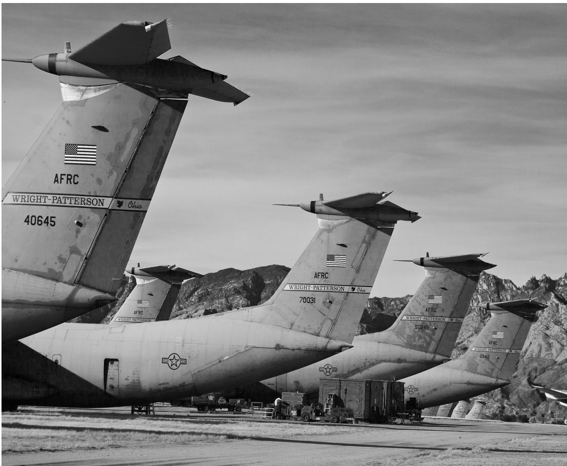
C-141s in the dirt