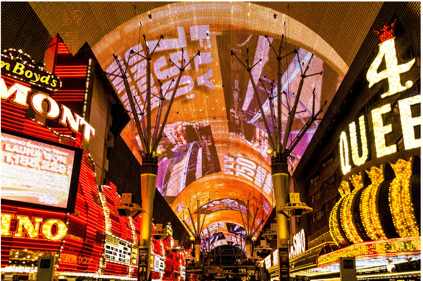
The Fremont Street Experience

Golden Contrails C/O Charlie Starr 4328 Sunset Beach Circle Niceville, FL 32578-4820